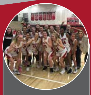
The Braves are back-to-back CHL basketball champs!