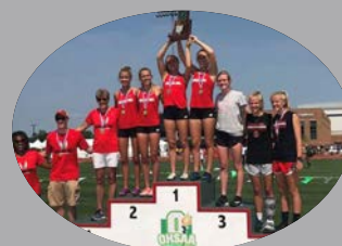
2019 Girls Track State Champions