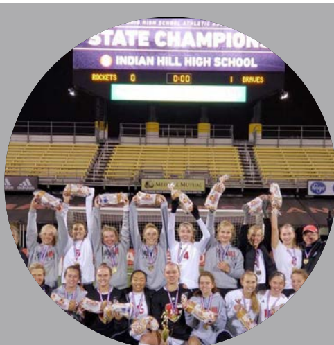
2018 Girls Soccer Back-to-Back State Champions