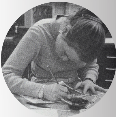
Indian Hill Classroom in 1993

Looking ahead, we will continue to seek efficiencies in operations and facility maintenance.