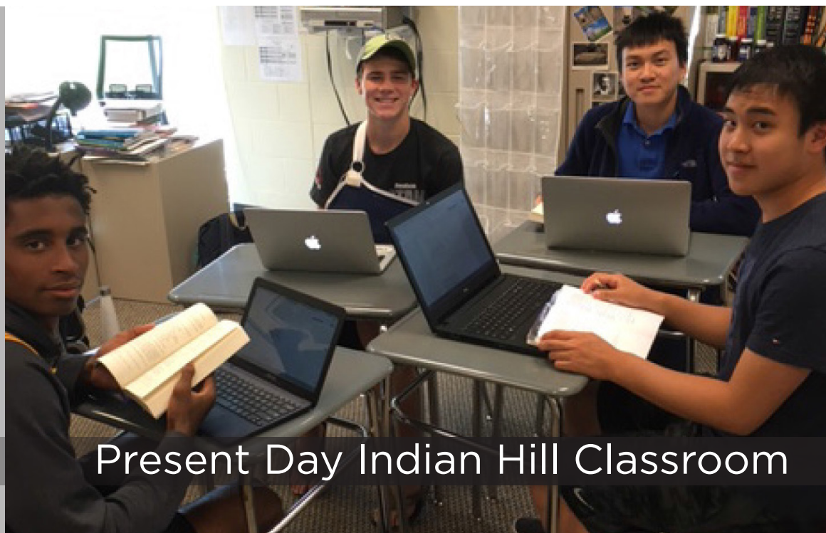
Present Day Indian Hill Classroom