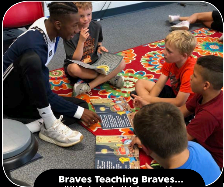
Braves Teaching Braves... IHHS student-athletes read to IHPS students as part of a national mentoring/reading program!