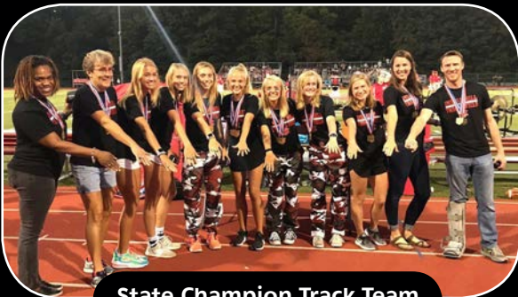
State Champion Track Team Ring Ceremony!