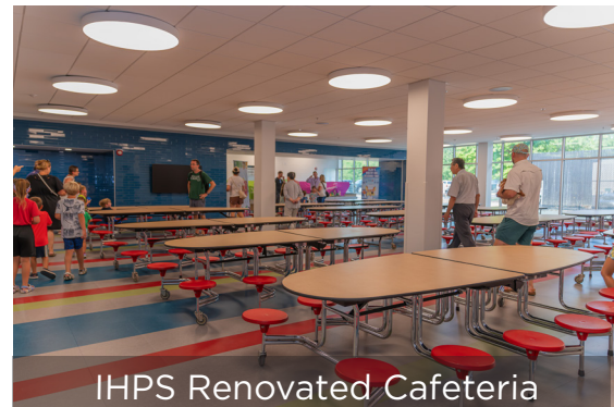
IHPS Renovated Cafeteria