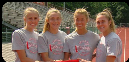
4x400 Meter Relay