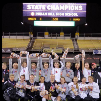
2017 & 2018 Girls Soccer Back-to-Back State Champions

In 2018-2019, IHHS students competed in 24 sports with 43 teams, and participated in more than 50 student clubs – 95% student participation!