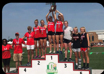
2019 Girls Track State Champions