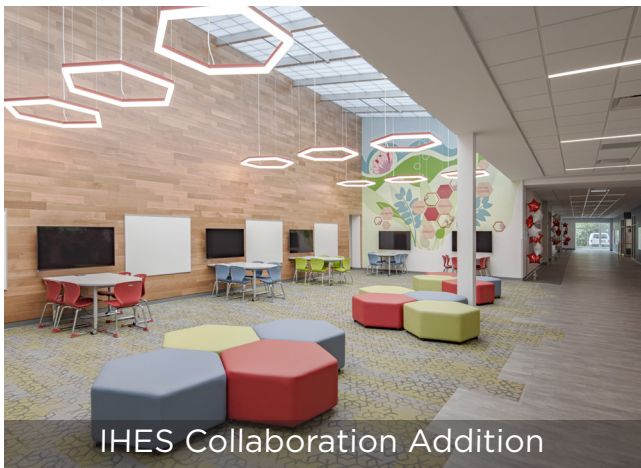
IHES Collaboration Addition