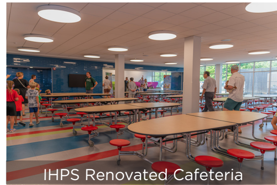
IHPs Renovated Cafeteria