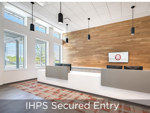
IHPs Secured Entry