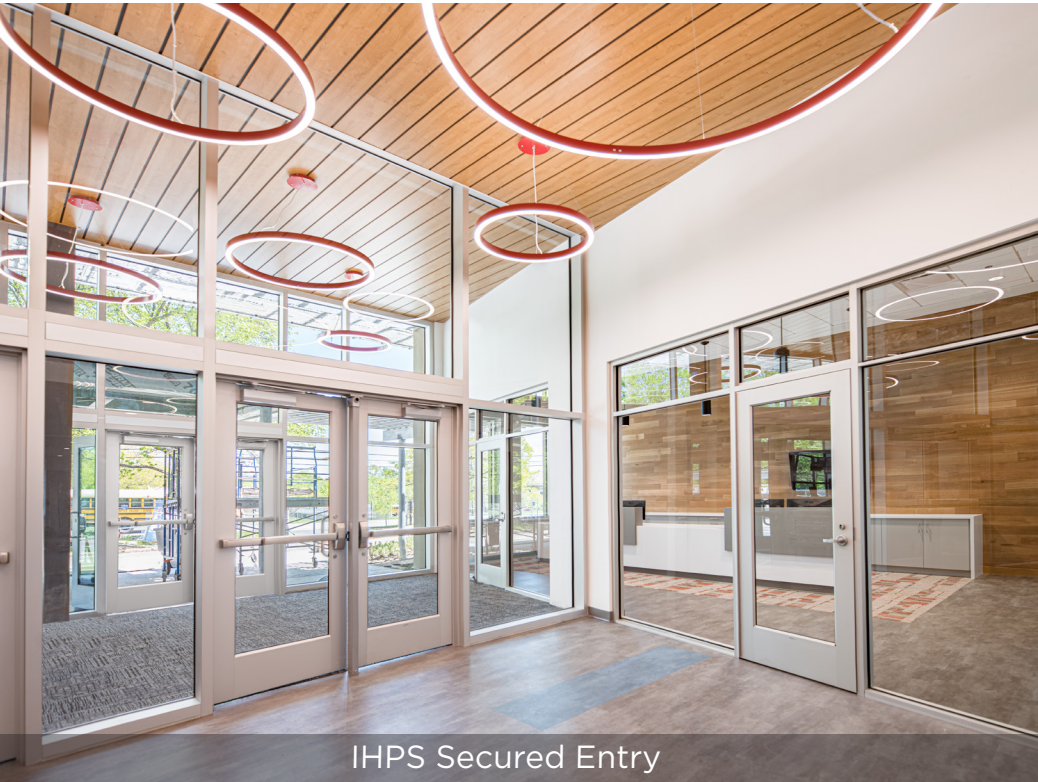
IHPs Secured Entry

Thank you to every Brave who made our Magical Reveal of Indian Hill Primary School & Indian Hill Elementary School such a special event!