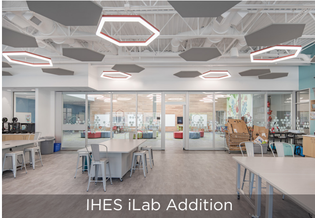
IHES iLab Addition