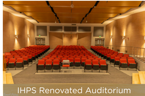
IHPs Renovated Auditorium