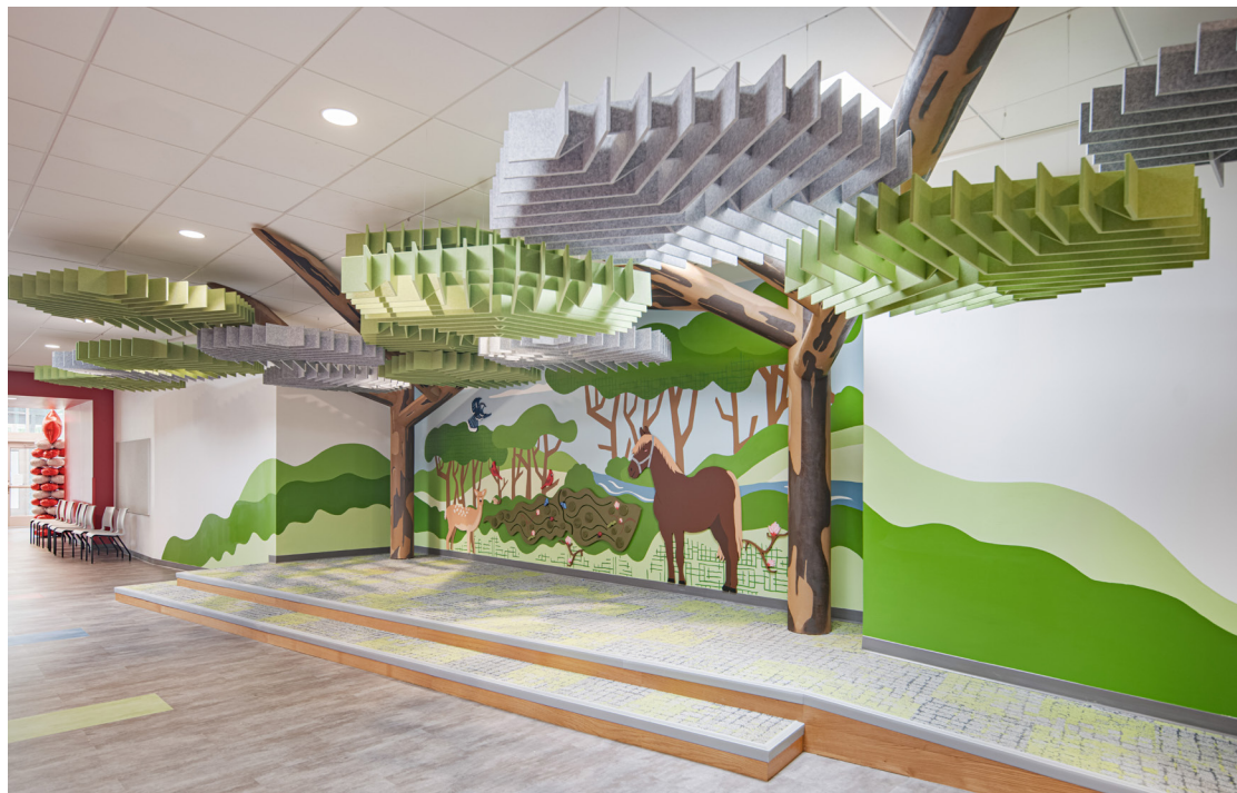
IHPs Interactive Learning Lobby