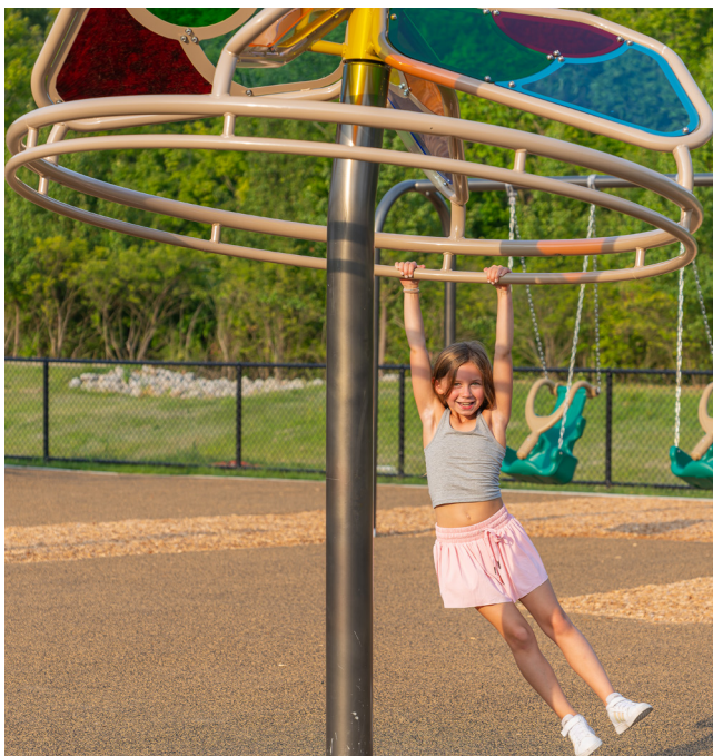
IHES Student-Designed Playground